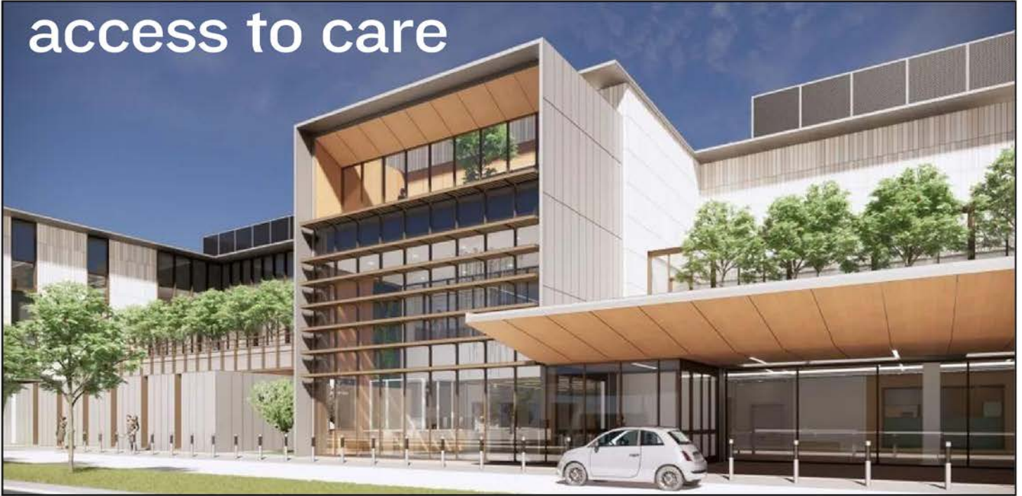
New Behavioral Health Child, Adolescent and Adult Services Center in San Jose. Opens 2025

With support from the County of Santa Clara Board of Supervisors and the County Executive, the Health System is making significant investments in new facilities, programs, and services and finding new ways to connect behavioral health care with medical care to bring health and healing to the whole person. Expanding access to care also improves health equity in our community — a goal shared throughout our system.